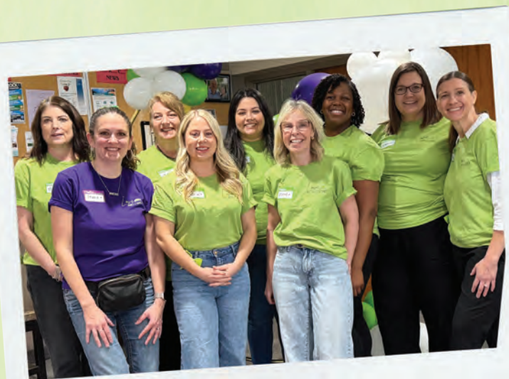
♥ BEGINNINGS STAFF

It was great to see so many smiling faces, and to catch up on family updates. From all of us at Beginnings, thank you for being part of our community—you're the heart of everything we do!