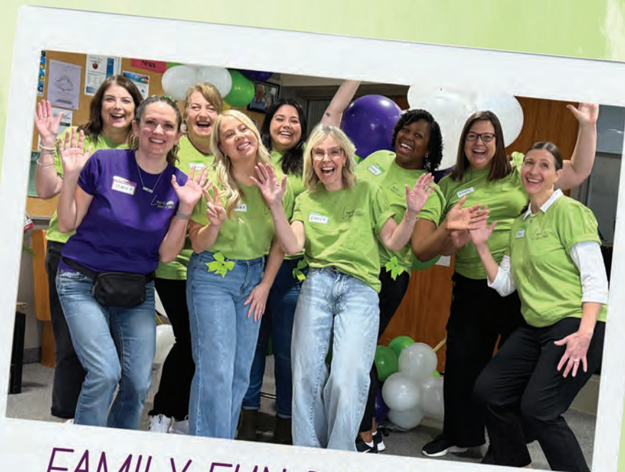
FAMILY FUN DAY '25 ♥